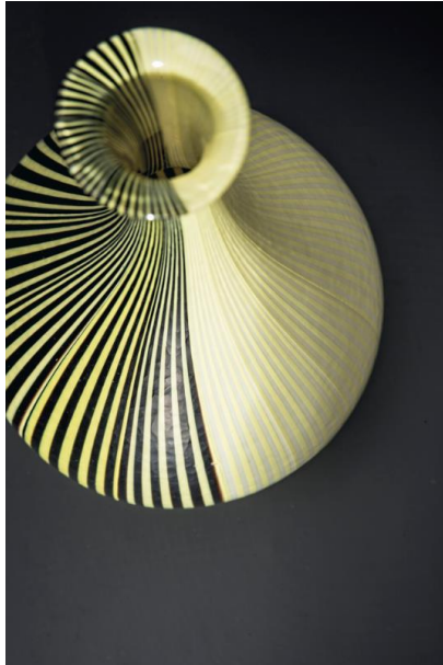
CARLO SCARPA (1906-1978) A 'TESSUTO-BATTUTO' VASE, DESIGNED 1938-40 Estimate: $20,000-30,000