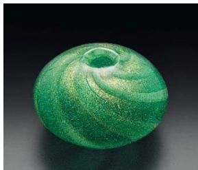
CARLO SCARPA (1906-1978) A 'SOMMERSO' VASE, CIRCA 1934- 36 Estimate: $30,000-40,000