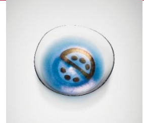
CARLO SCARPA (1906-1978) A RARE 'A MACCHIE' BOWL, CIRCA 1942 Estimate: $35,000-45,000