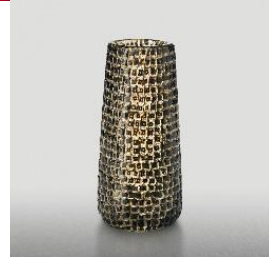
CARLO SCARPA (1906-1978) A RARE 'MURRINE ROMANE' VASE, CIRCA 1936 Estimate: $40,000-60,000