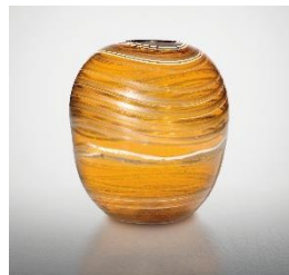
CARLO SCARPA (1906-1978) A RARE 'A FILI' VASE, CIRCA 1942 Estimate: $30,000-40,000