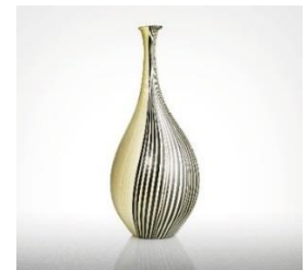
CARLO SCARPA (1906-1978) A 'TESSUTO-BATTUTO' VASE, DESIGNED 1938-40 Estimate: $20,000-30,000