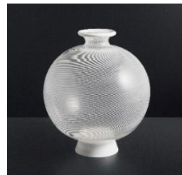
CARLO SCARPA (1906-1978) A 'MEZZA FILGRANA' VASE, CIRCA 1935 Estimate: $10,000-15,000