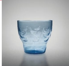
CARLO SCARPA (1906-1978) AN 'INCISI' VASE, CIRCA 1942 Estimate: $20,000-30,000